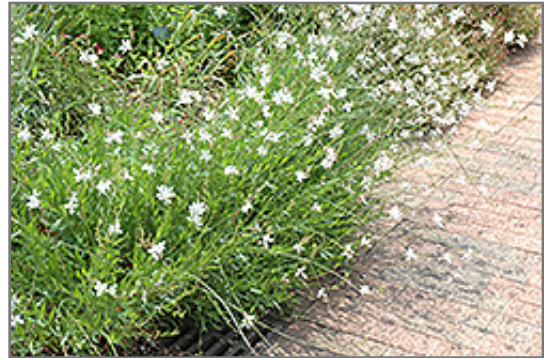
Whirling Butterflies Gaura in bloom