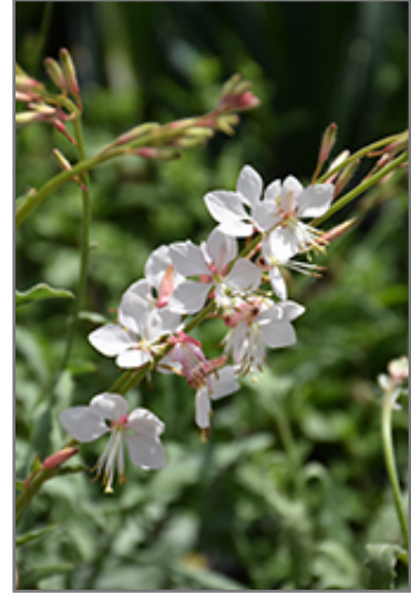
Whirling Butterflies Gaura flowers

This is a relatively low maintenance plant, and is best cleaned up in early spring before it resumes active growth for the season. It is a good choice for attracting butterflies to your yard, but is not particularly attractive to deer who tend to leave it alone in favor of tastier treats. It has no significant negative characteristics.