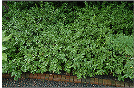
Sarcoxie Wintercreeper

This shrub performs well in both full sun and full shade. It is very adaptable to both dry and moist locations, and should do just fine under average home landscape conditions. It is not particular as to soil type or pH. It is highly tolerant of urban pollution and will even thrive in inner city environments, and will benefit from being planted in a relatively sheltered location. This is a selected variety of a species not originally from North America.