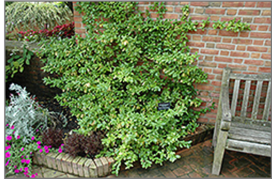
Sarcoxie Wintercreeper

Sarcoxie Wintercreeper is recommended for the following landscape applications;