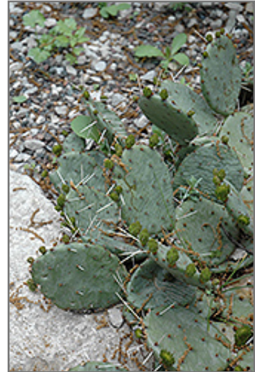
Eastern Prickly Pear Cactus