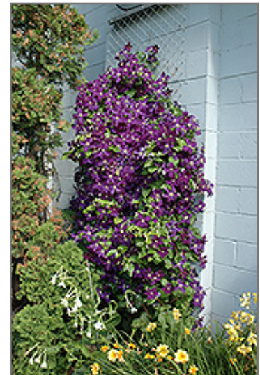
Jackmanii Superba Clematis in bloom