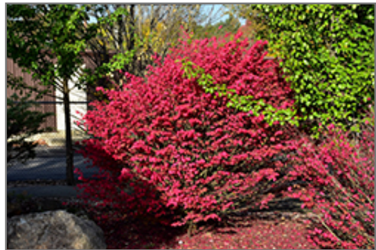
Little Moses Burning Bush in fall