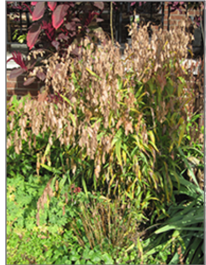
Northern Sea Oats

Northern Sea Oats is a fine choice for the garden, but it is also a good selection for planting in outdoor pots and containers. Because of its height, it is often used as a 'thriller' in the 'spiller-thriller-filler' container combination; plant it near the center of the pot, surrounded by smaller plants and those that spill over the edges. It is even sizeable enough that it can be grown alone in a suitable container. Note that when growing plants in outdoor containers and baskets, they may require more frequent waterings than they would in the yard or garden.