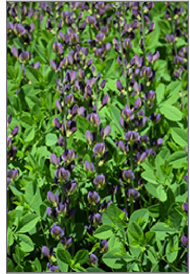
Twilite Prairieblues False Indigo flowers

Twilite Prairieblues False Indigo is recommended for the following landscape applications;