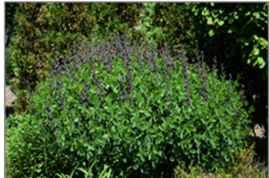
Twilite Prairieblues False Indigo in bloom