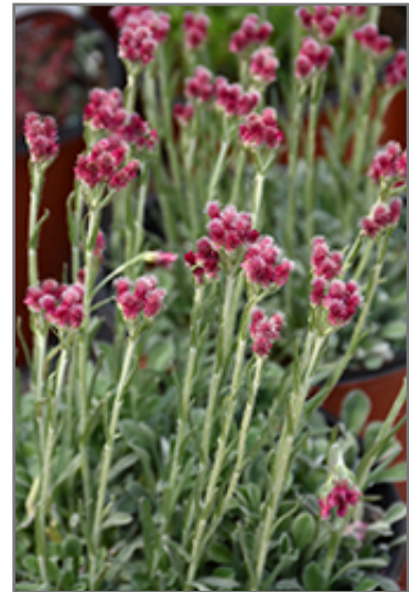
Red Pussytoes flowers

Red Pussytoes is recommended for the following landscape applications;