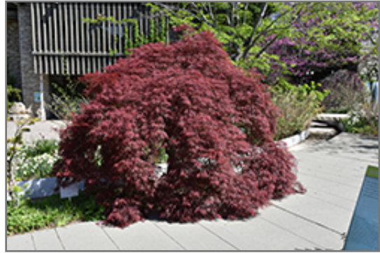
Inaba Shidare Cutleaf Japanese Maple

Inaba Shidare Cutleaf Japanese Maple is recommended for the following landscape applications;