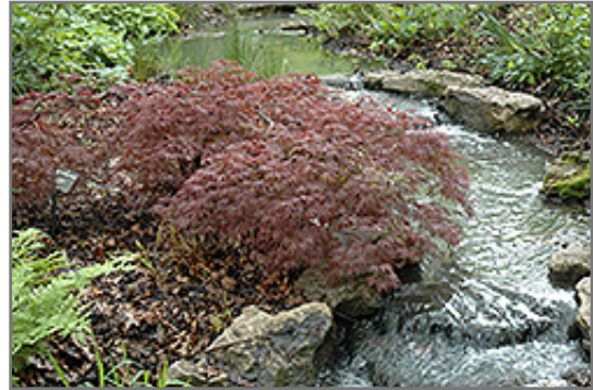
Inaba Shidare Cutleaf Japanese Maple

Inaba Shidare Cutleaf Japanese Maple will grow to be about 8 feet tall at maturity, with a spread of 8 feet. It tends to be a little leggy, with a typical clearance of 2 feet from the ground, and is suitable for planting under power lines. It grows at a medium rate, and under ideal conditions can be expected to live for 60 years or more.