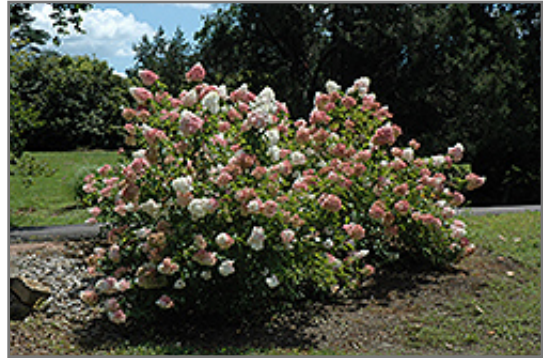
Vanilla Strawberry Hydrangea in bloom