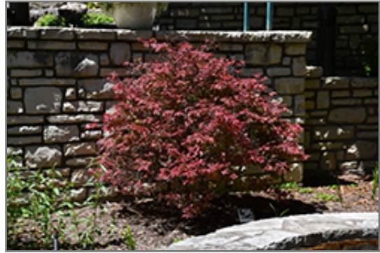
Shaina Japanese Maple

Shaina Japanese Maple is recommended for the following landscape applications;