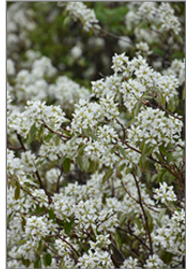
Saskatoon flowers

Saskatoon is a multi-stemmed deciduous shrub with an upright spreading habit of growth. Its relatively fine texture sets it apart from other landscape plants with less refined foliage.