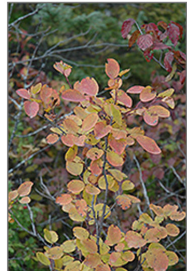
Saskatoon in fall