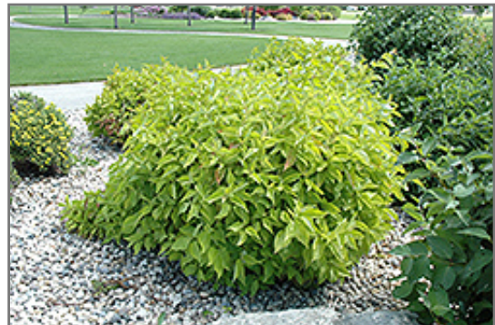
Prairie Fire Dogwood