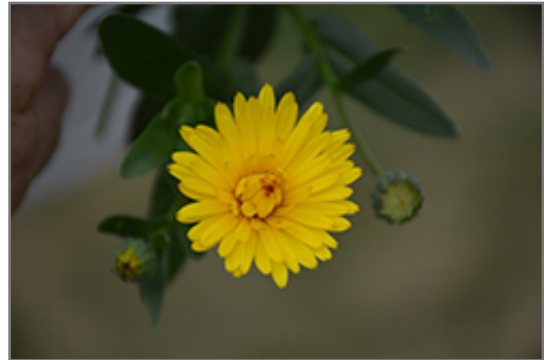
Lady Godiva Yellow Marigold flowers