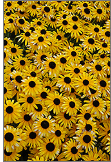
Viette's Little Suzy Coneflower flowers