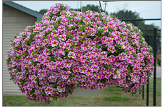
Superbells Holy Cow! Calibrachoa in bloom