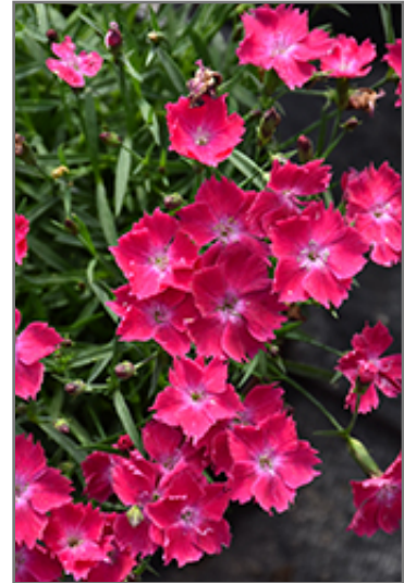
Beauties Kahori Scarlet Pinks flowers

This is a relatively low maintenance plant, and is best cleaned up in early spring before it resumes active growth for the season. It is a good choice for attracting bees and butterflies to your yard, but is not particularly attractive to deer who tend to leave it alone in favor of tastier treats. It has no significant negative characteristics.