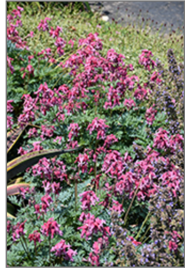
Pink Diamonds Fern-leaved Bleeding Heart flowers

Pink Diamonds Fern-leaved Bleeding Heart is an herbaceous perennial with a mounded form. It brings an extremely fine and delicate texture to the garden composition and should be used to full effect.