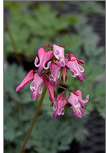
Pink Diamonds Fern-leaved Bleeding Heart flowers

Pink Diamonds Fern-leaved Bleeding Heart is a fine choice for the garden, but it is also a good selection for planting in outdoor pots and containers. It is often used as a 'filler' in the 'spiller-thriller-filler' container combination, providing a mass of flowers and foliage against which the thriller plants stand out. Note that when growing plants in outdoor containers and baskets, they may require more frequent waterings than they would in the yard or garden .