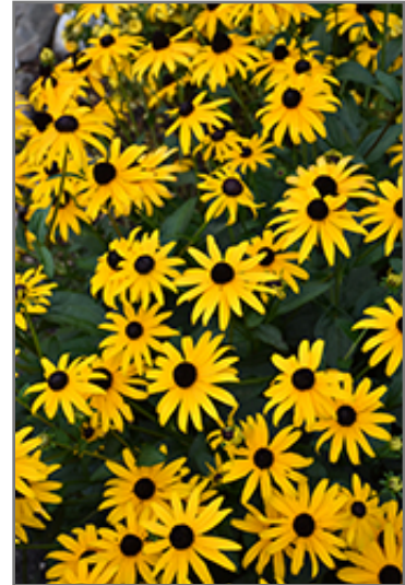
American Gold Rush Coneflower flowers

This is a relatively low maintenance plant, and should be cut back in late fall in preparation for winter. It is a good choice for attracting birds, bees and butterflies to your yard, but is not particularly attractive to deer who tend to leave it alone in favor of tastier treats. It has no significant negative characteristics.