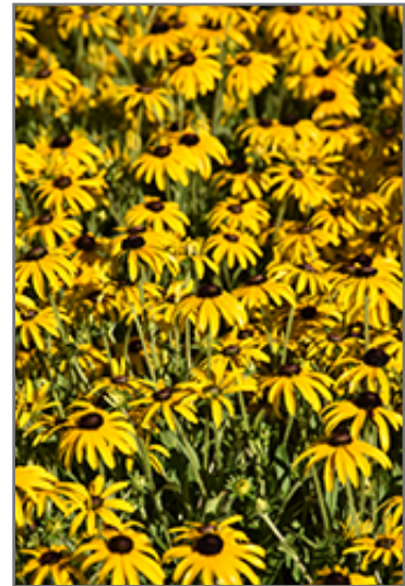
American Gold Rush Coneflower flowers

American Gold Rush Coneflower is a fine choice for the garden, but it is also a good selection for planting in outdoor pots and containers. With its upright habit of growth, it is best suited for use as a 'thriller' in the 'spiller-thriller-filler' container combination; plant it near the center of the pot, surrounded by smaller plants and those that spill over the edges. Note that when growing plants in outdoor containers and baskets, they may require more frequent waterings than they would in the yard or garden.