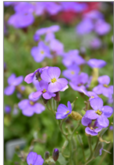
Cascade Blue Rock Cress flowers