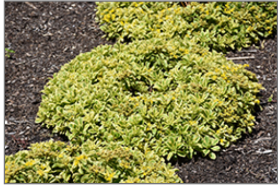
Cutting Edge Stonecrop

Cutting Edge Stonecrop will grow to be only 6 inches tall at maturity, with a spread of 16 inches. When grown in masses or used as a bedding plant, individual plants should be spaced approximately 12 inches apart. Its foliage tends to remain low and dense right to the ground. It grows at a fast rate, and under ideal conditions can be expected to live for approximately 15 years. As an herbaceous perennial, this plant will usually die back to the crown each winter, and will regrow from the base each spring. Be careful not to disturb the crown in late winter when it may not be readily seen!