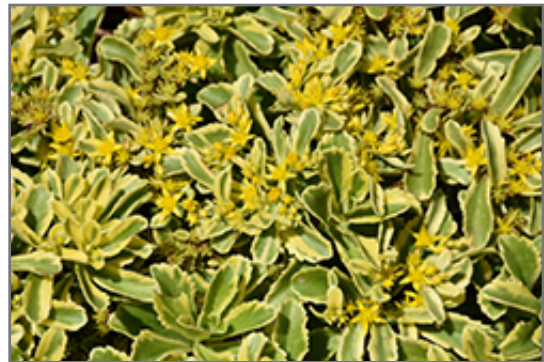
Cutting Edge Stonecrop flowers