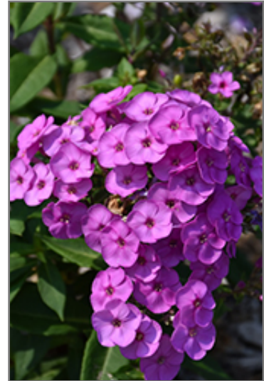
Ka-Pow Lavender Garden Phlox flowers

Ka-Pow Lavender Garden Phlox is recommended for the following landscape applications;