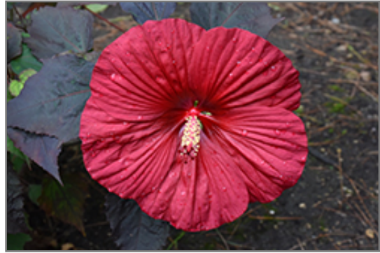
Summerific Holy Grail Hibiscus flowers

Summerific Holy Grail Hibiscus is an herbaceous perennial with an upright spreading habit of growth. Its relatively coarse texture can be used to stand it apart from other garden plants with finer foliage.