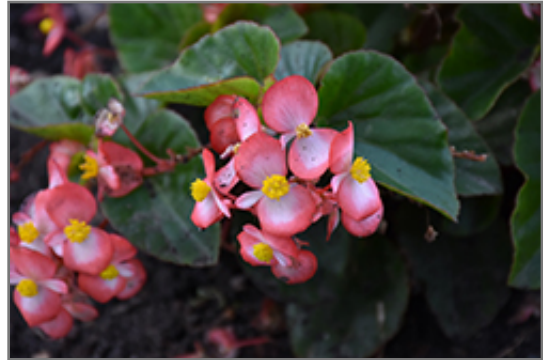
BabyWing Pink Bicolor Begonia flowers

BabyWing Pink Bicolor Begonia is recommended for the following landscape applications;