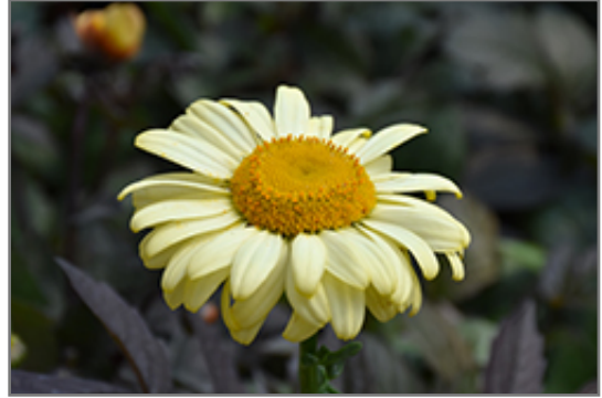
Spellbook Lumos Shasta Daisy flowers

An outstanding shasta daisy producing sunny yellow blooms with golden centers that are long lasting and fade resistant; a beautiful addition to the garden when massed; blooms throughout the summer