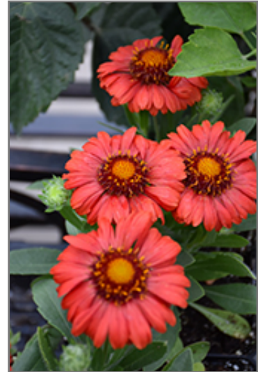
Sunset Celebration Blanket Flower flowers

Sunset Celebration Blanket Flower is recommended for the following landscape applications;