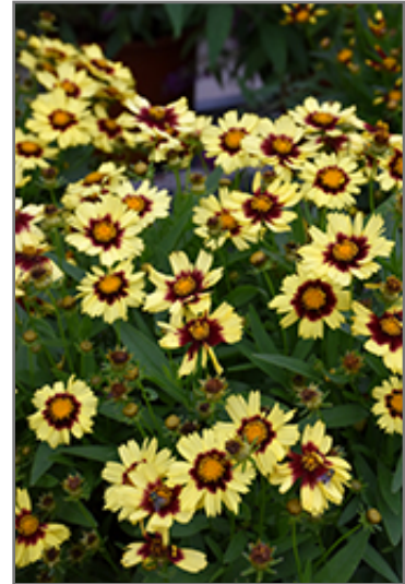
UpTick Yellow and Red Tickseed flowers

UpTick Yellow and Red Tickseed is a fine choice for the garden, but it is also a good selection for planting in outdoor pots and containers. It is often used as a 'filler' in the 'spiller-thriller-filler' container combination, providing a mass of flowers against which the thriller plants stand out. Note that when growing plants in outdoor containers and baskets, they may require more frequent waterings than they would in the yard or garden.