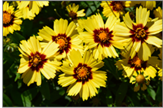
UpTick Yellow and Red Tickseed flowers

UpTick Yellow and Red Tickseed is recommended for the following landscape applications;