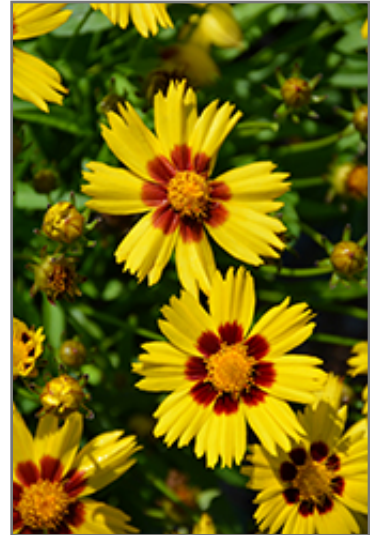
Sunkiss Tickseed flowers