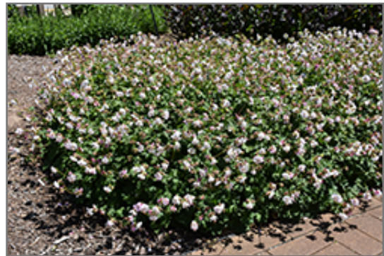
Biokovo Cranesbill in bloom