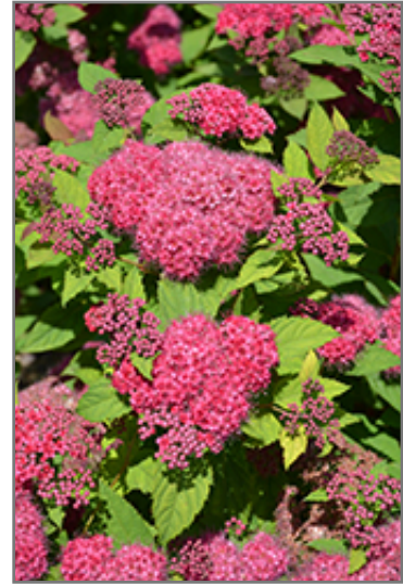
Double Play Red Spirea flowers

Double Play Red Spirea is recommended for the following landscape applications;