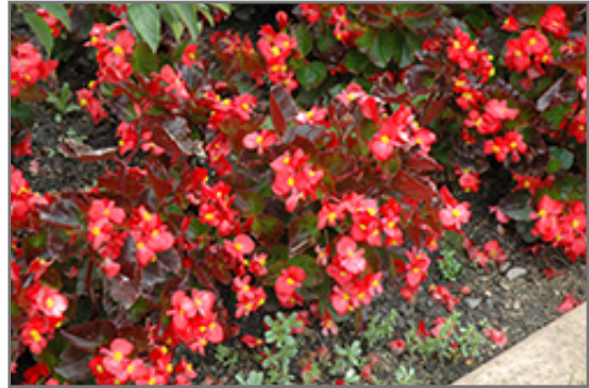
BabyWing Red Begonia flowers

This is a high maintenance plant that will require regular care and upkeep, and usually looks its best without pruning, although it will tolerate pruning. Deer don't particularly care for this plant and will usually leave it alone in favor of tastier treats. Gardeners should be aware of the following characteristic(s) that may warrant special consideration;