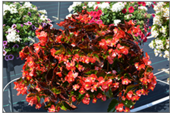
BabyWing Red Begonia in bloom