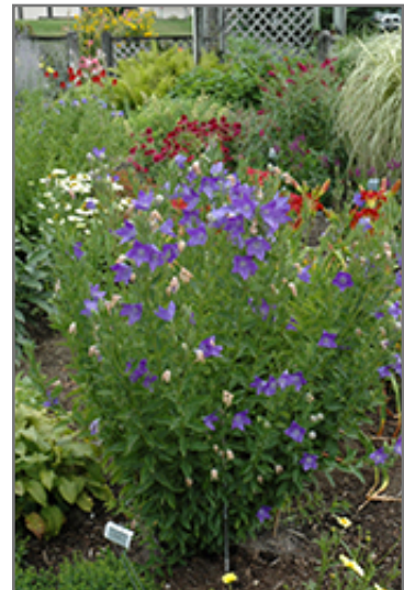
Fuji Blue Balloon Flower in bloom