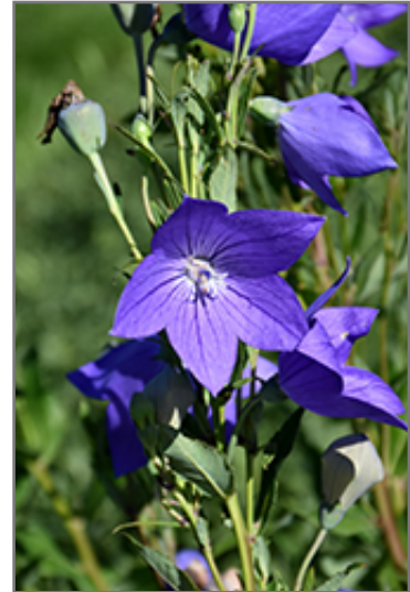
Fuji Blue Balloon Flower flowers