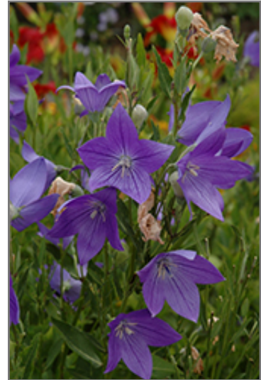
Fuji Blue Balloon Flower flowers