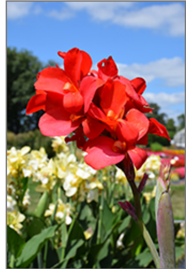
Cannova Bronze Scarlet Canna flowers

Cannova Bronze Scarlet Canna is a fine choice for the garden, but it is also a good selection for planting in outdoor pots and containers. With its upright habit of growth, it is best suited for use as a 'thriller' in the 'spiller-thriller-filler' container combination; plant it near the center of the pot, surrounded by smaller plants and those that spill over the edges. It is even sizeable enough that it can be grown alone in a suitable container. Note that when growing plants in outdoor containers and baskets, they may require more frequent waterings than they would in the yard or garden. Be aware that in our climate, this plant may be too tender to survive the winter if left outdoors in a container. Contact our experts for more information on how to protect it over the winter months.