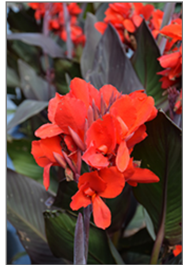
Cannova Bronze Scarlet Canna flowers

This plant is native to the tropics and prefers growing in moist environments with evenly warm conditions all year round. In our climate, it is usually grown as an outdoor annual in the garden or in a container. If you want it to survive the winter, it can be brought in to the house and provided with special care, and then returned to the garden the following season. In its preferred tropical habitat, it can grow to be around 4 feet tall at maturity, with a spread of 20 inches. However, when grown as an annual or when overwintered indoors, it can be expected to perform differently, and its exact height and spread will depend on many factors; you may wish to consult with our experts as to how it might perform in your specific application and growing conditions.