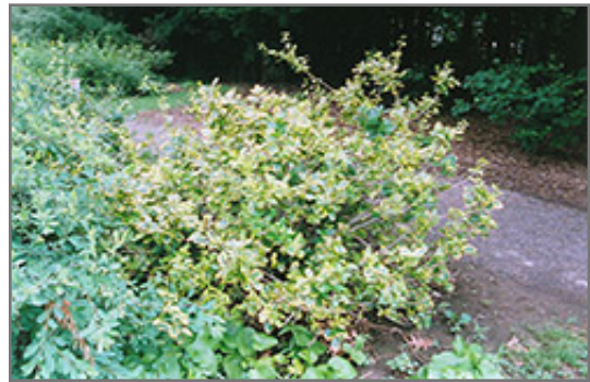
E.T. Gold Wintercreeper