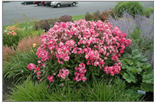
Garden Girls Glamour Girl Garden Phlox in bloom

Garden Girls Glamour Girl Garden Phlox will grow to be about 28 inches tall at maturity, with a spread of 24 inches. When grown in masses or used as a bedding plant, individual plants should be spaced approximately 18 inches apart. It grows at a medium rate, and under ideal conditions can be expected to live for approximately 10 years. As an herbaceous perennial, this plant will usually die back to the crown each winter, and will regrow from the base each spring. Be careful not to disturb the crown in late winter when it may not be readily seen!