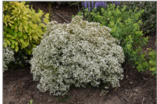
Summer Sparkles Baby's Breath in bloom