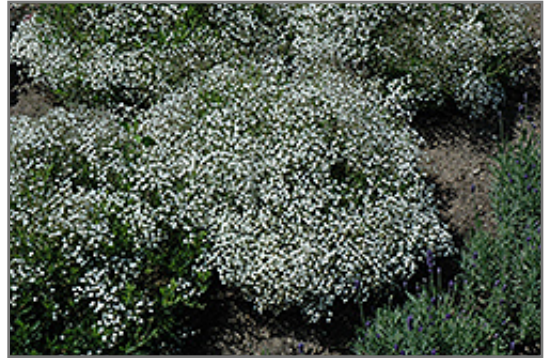
Summer Sparkles Baby's Breath in bloom

This plant should only be grown in full sunlight. It prefers dry to average moisture levels with very well-drained soil, and will often die in standing water. It is considered to be drought-tolerant, and thus makes an ideal choice for a low-water garden or xeriscape application. It is not particular as to soil type, but has a definite preference for alkaline soils, and is able to handle environmental salt. It is highly tolerant of urban pollution and will even thrive in inner city environments. This is a selected variety of a species not originally from North America.