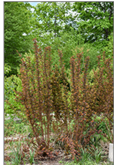
Mahogany Magic Ninebark