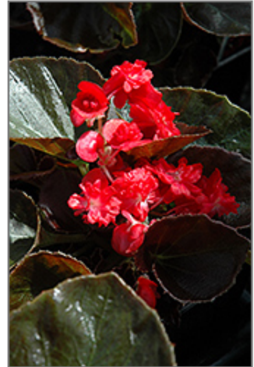
Doublet Red Begonia flowers