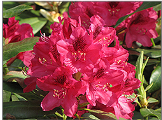
Nova Zembla Rhododendron flowers