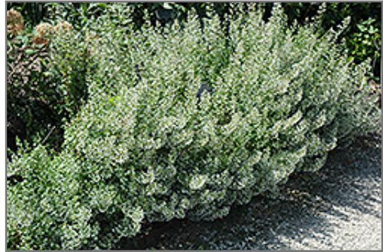
Montrose White Dwarf Calamint in bloom