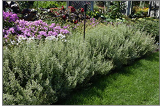
Montrose White Dwarf Calamint in bloom

Montrose White Dwarf Calamint is a fine choice for the garden, but it is also a good selection for planting in outdoor pots and containers. It is often used as a 'filler' in the 'spiller-thriller-filler' container combination, providing a mass of flowers against which the larger thriller plants stand out. Note that when growing plants in outdoor containers and baskets, they may require more frequent waterings than they would in the yard or garden.