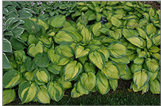
Paradigm Hosta