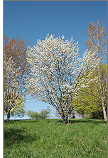
Princess Diana Serviceberry in bloom