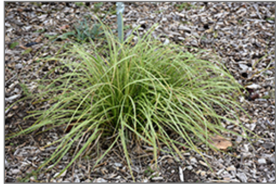
Gold Fountains Sedge