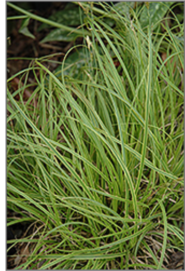
Gold Fountains Sedge foliage

Gold Fountains Sedge is recommended for the following landscape applications;