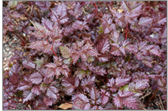
Delft Lace Astilbe foliage

Delft Lace Astilbe will grow to be about 16 inches tall at maturity extending to 24 inches tall with the flowers, with a spread of 12 inches. When grown in masses or used as a bedding plant, individual plants should be spaced approximately 12 inches apart. Its foliage tends to remain dense right to the ground, not requiring facer plants in front. It grows at a medium rate, and under ideal conditions can be expected to live for approximately 10 years. As an herbaceous perennial, this plant will usually die back to the crown each winter, and will regrow from the base each spring. Be careful not to disturb the crown in late winter when it may not be readily seen!