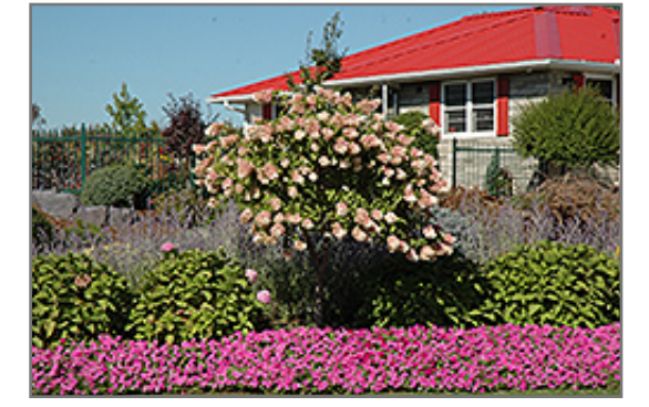
Tree Form Pee Gee Hydrangea in bloom

Tree Form Pee Gee Hydrangea features bold conical white flowers at the ends of the branches from mid summer to late fall. The flowers are excellent for cutting. It has green deciduous foliage. The pointy leaves do not develop any appreciable fall colour.