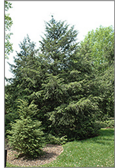
Eastern Hemlock