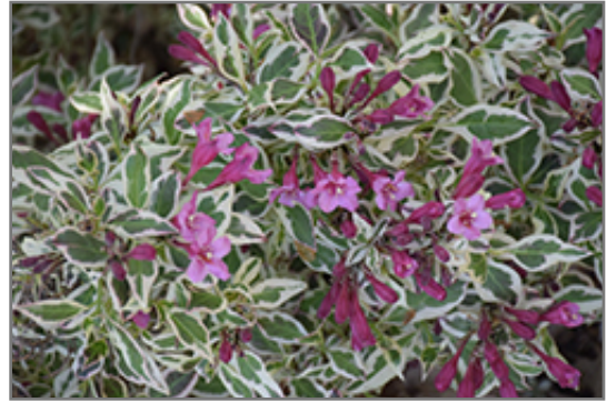
My Monet Weigela flowers

My Monet Weigela is recommended for the following landscape applications;