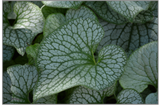
Sterling Silver Bugloss foliage

Sterling Silver Bugloss will grow to be about 12 inches tall at maturity, with a spread of 24 inches. When grown in masses or used as a bedding plant, individual plants should be spaced approximately 20 inches apart. It grows at a medium rate, and under ideal conditions can be expected to live for approximately 10 years. As an herbaceous perennial, this plant will usually die back to the crown each winter, and will regrow from the base each spring. Be careful not to disturb the crown in late winter when it may not be readily seen!