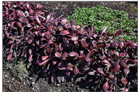
Flirt Bergenia foliage