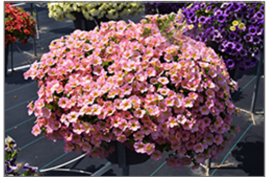
Superbells Honeyberry Calibrachoa in bloom